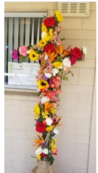
The Cross on the Church walkway for all to admire as they pass by the Church.