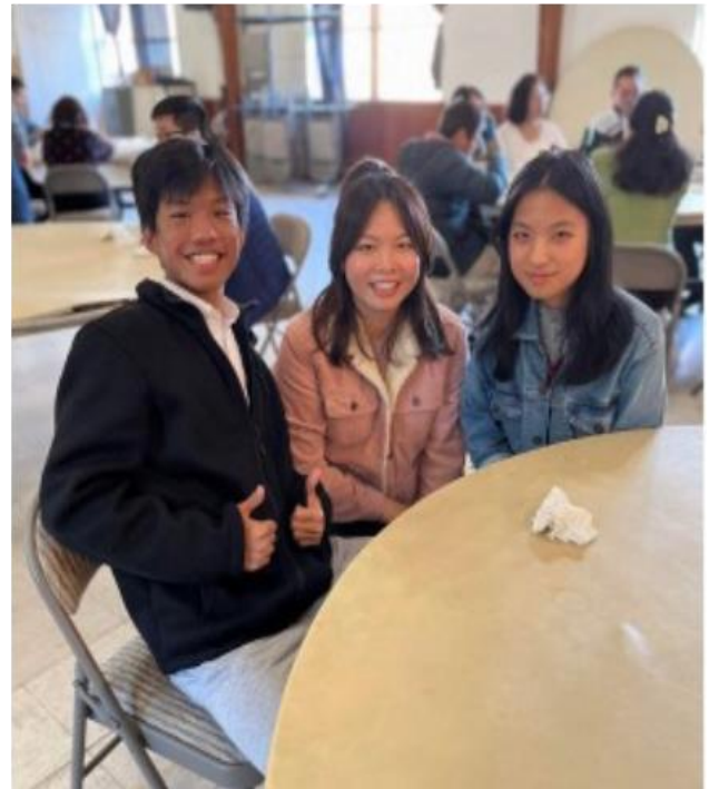
At San Jose Burmese Church w/ Associate Pastor