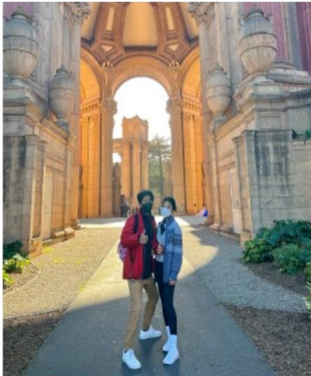
At Palace of Fine Arts, SF